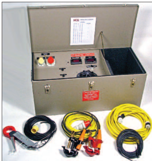
2" Current Transformer and Cord