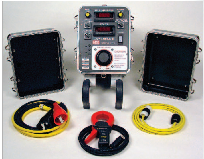
Shown with Optional 2" CT (CT002/III)

Note: Most inverters & generators will not provide a suitable power supply - consult factory.