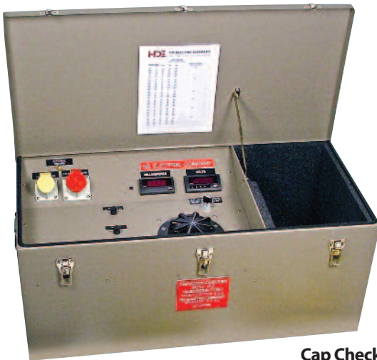
Cap Check II