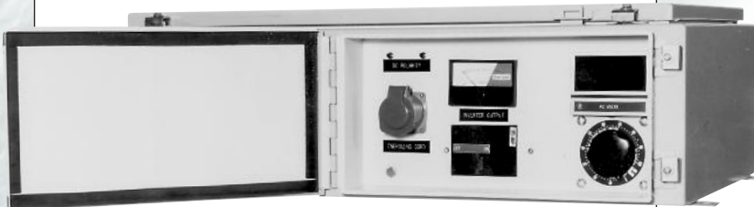
Cap Check I