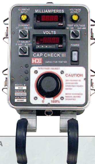
Cap Check III